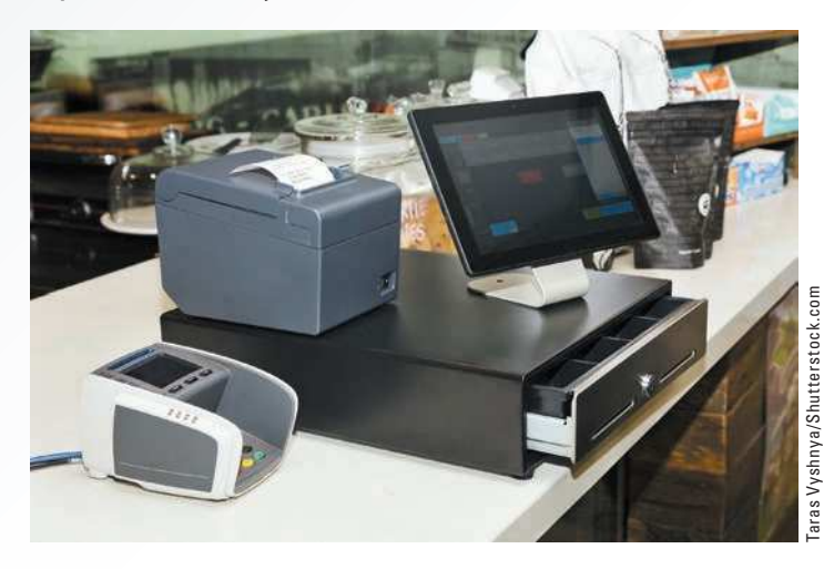
Exhibit 1.1 A point-of-sale system

MODULE 1: Information Systems in Business